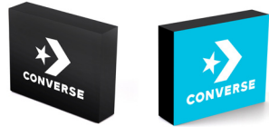
TWO SIDED LOGO PLAQUE LCTLOGOPLQ (5inx5inx1in)