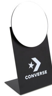
MIRROR CNAM (7inx14inx4.5in)