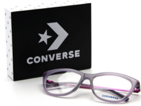
LOGO PLAQUE CNLP (5inx5inx1in)