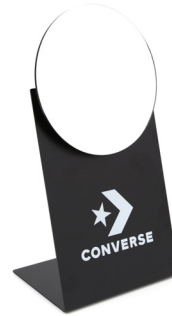
MIRROR CNAM (7inx14inx4.5in)