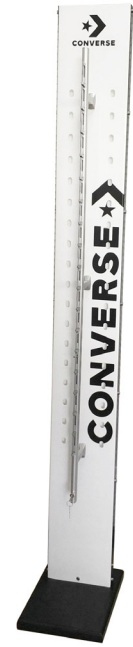
FLOOR DISPLAY PUESX858N04 (12inx12inx70in)