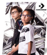
COUNTERCARD CCK305K405 (6inx9in)