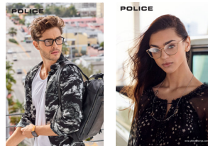
TENTCARD PCTCOPT (6inx9in) VPL886 VPL926