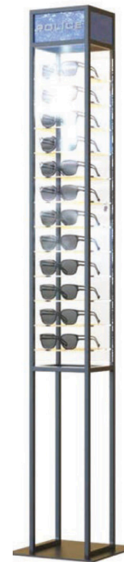
FLOOR DISPLAY (12 PIECE) PUESX701N07C (32cmx176x32cm)