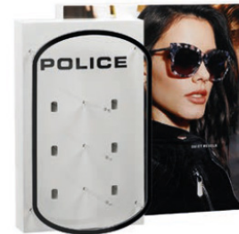
3PC. DISPLAY PUESX701N11