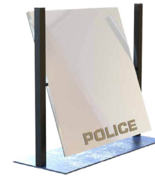
MIRROR PU00X701N07C (20cmx20x9cm)