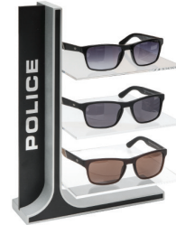
3 PC. DISPLAY PUESX401N02 (23cmx35cmx20cm)