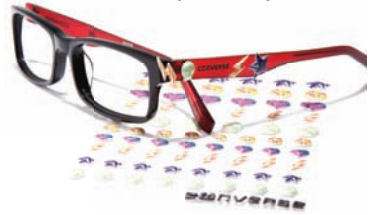
Converse Puffy Eyewear Stickers