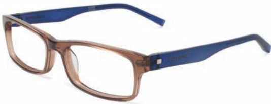
Converse Kids K011