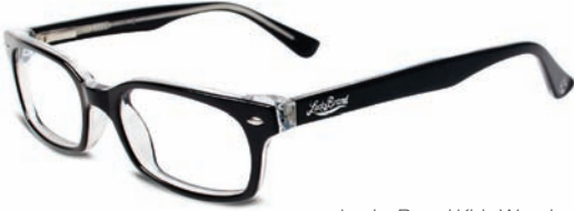
Lucky Brand Kids Wonder