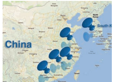
Optical Manufacturing in China