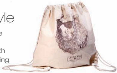
Lucky Brand Drawstring Tote

While supplies last. No substitutions. For U.S. independent customers only. Items may vary based on availability.