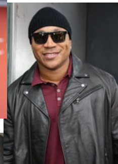
LL Cool J