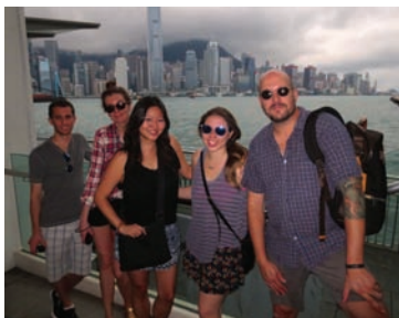
REM Product Team

Five fabulous people from Rem's creative team recently joined me on a product development sojourn in Hong Kong. Along the way, we met with 15 eyewear manufacturers, dreamed of new designs, technology and materials, and shared thoughts with suppliers about the future of eyewear-making amidst lightning fast changes in economic and political dynamics.