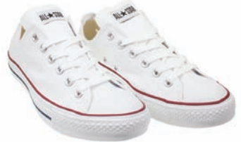
One Pair of Converse Low Tops Retail value $55.00