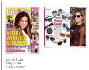
Life & Style May 2014 Lucky Brand