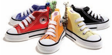
Chuck Taylor Shoe Keychain