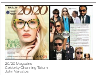
20/20 Magazine Celebrity Channing Tatum John Varvatos