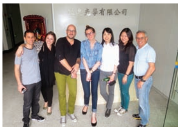
REM Product Team