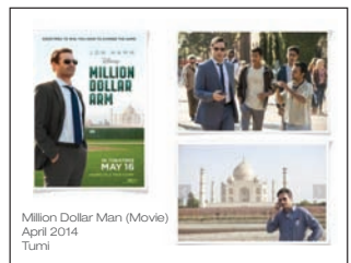
Million Dollar Man (Movie) April 2014 Turni