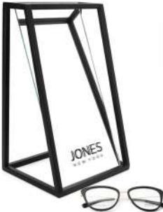
MIRROR JNYBCM (7inx12inx6in)