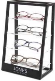
4 PC DISPLAY JNY4PD (7.5inx11.5inx4.5in)