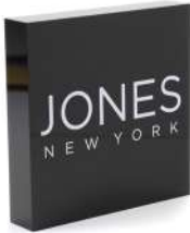
LOGO PLAQUE JNWALP (5inx5inx1in)