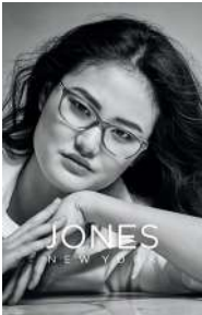
TENTCARD VJON782CC (7inx11in)