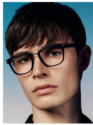
COUNTERCARD TCCVTU013 (7inx11in)