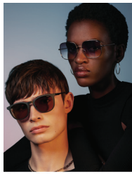
COUNTERCARD TUMISUNCC (7inx11in)