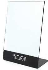
MIRROR PU00X79N03 (8inx4inx11in)