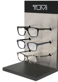
3PC. DISPLAY PUESA79N01 (8.25inx8inx13in)