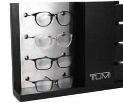
SLIMLOCK READER DISPLAY TUMIREADER16PC (16inx3.5inx12in)