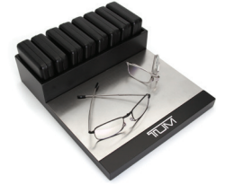
FOLDABLE READER DISPLAY TUMI8PCREADER (10inx11.25inx2.5in)